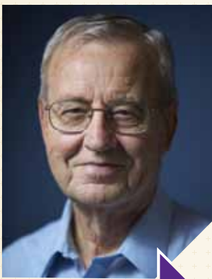
DALLAS WILLARD "KNOWLEDGE IN THE CONTEXT OF SPIRITUAL FORMATION"